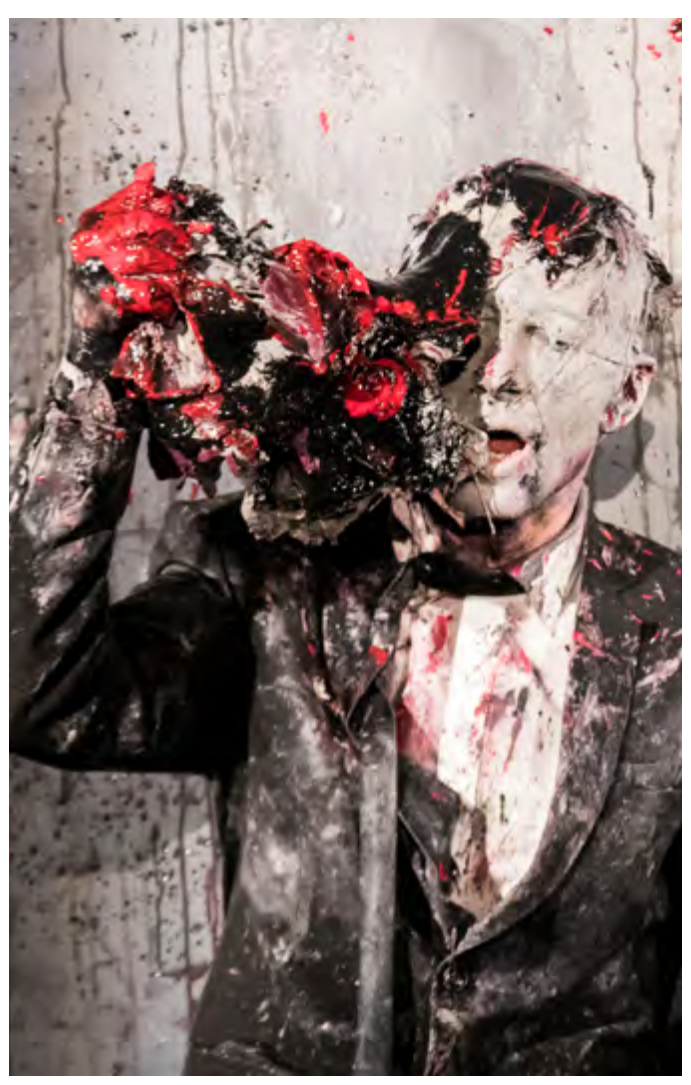
A still from a live performance by Olivier de Sagazan at Serendipity Arts Festival 2019.