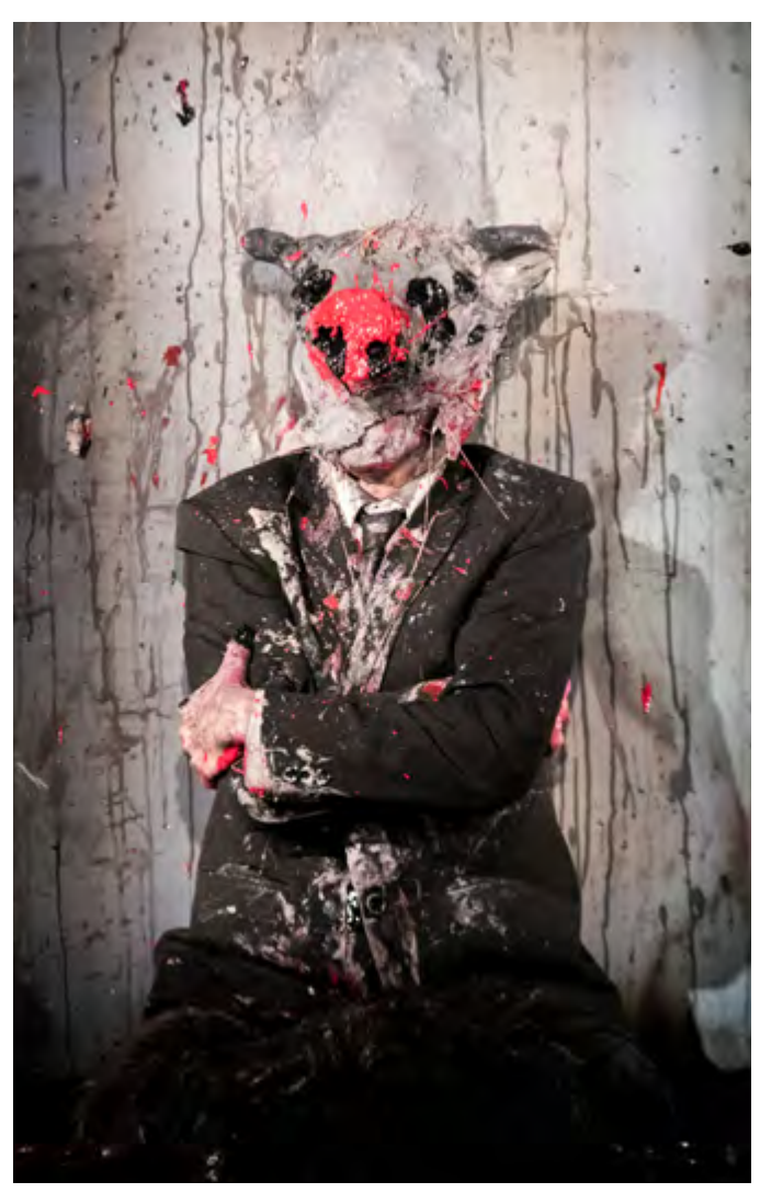
Still from a live performance by Olivier de Sagazan at Serendipity Arts Festival 2019.