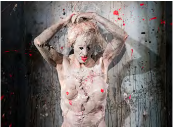
Stills from a live performance by Olivier de Sagazan at Serendipity Arts Festival 2019.