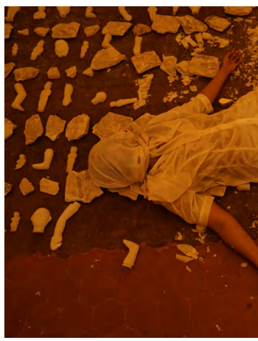
Still from a live performance by Venuri Perera at Serendipity Arts Festival 2019.