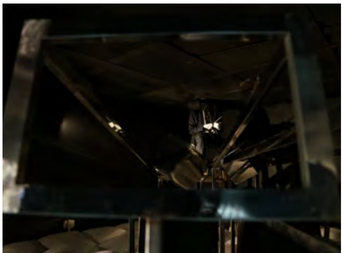
Stills from a live performance by Raghu Wodeyar at Serendipity Arts Festival 2019.