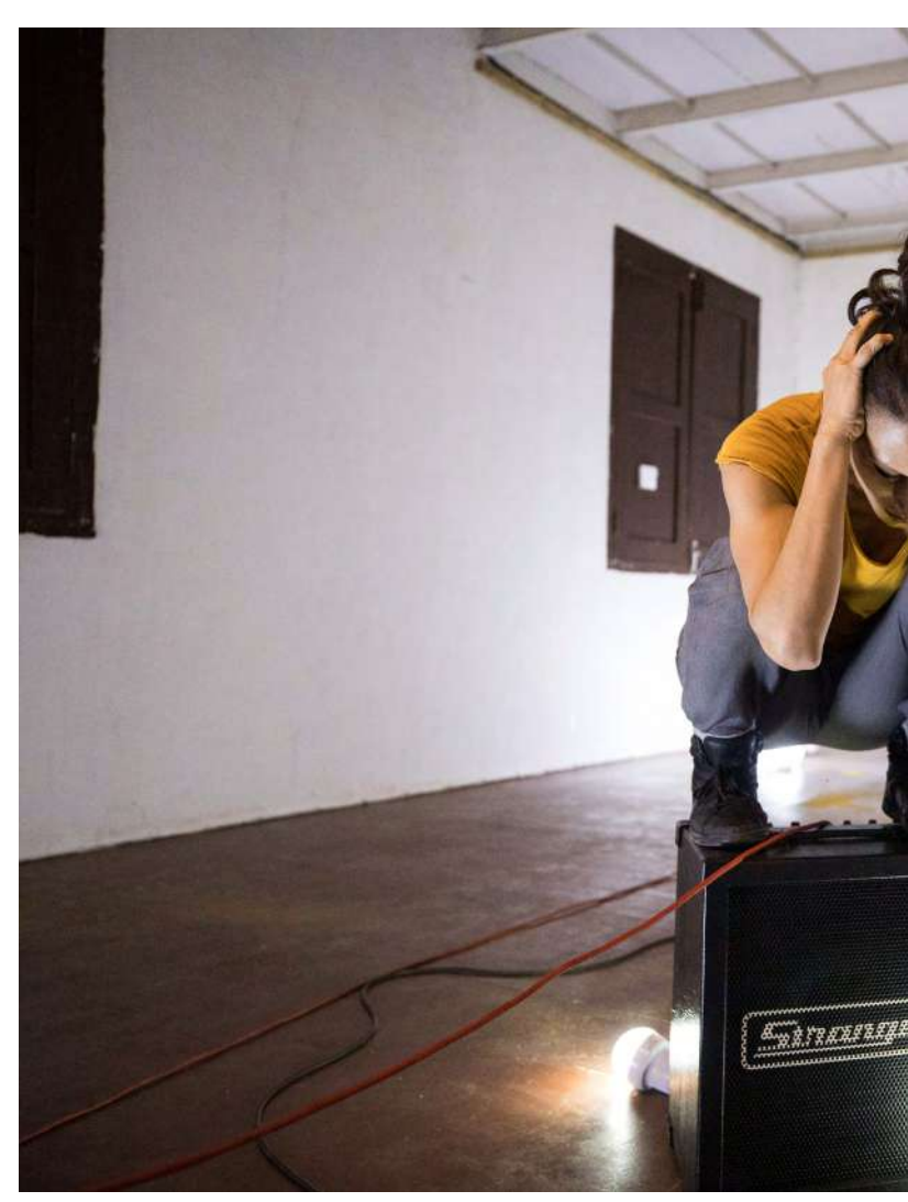
Still from a live performance of The Long and Short of It at Serendipity Arts Festival 2019.