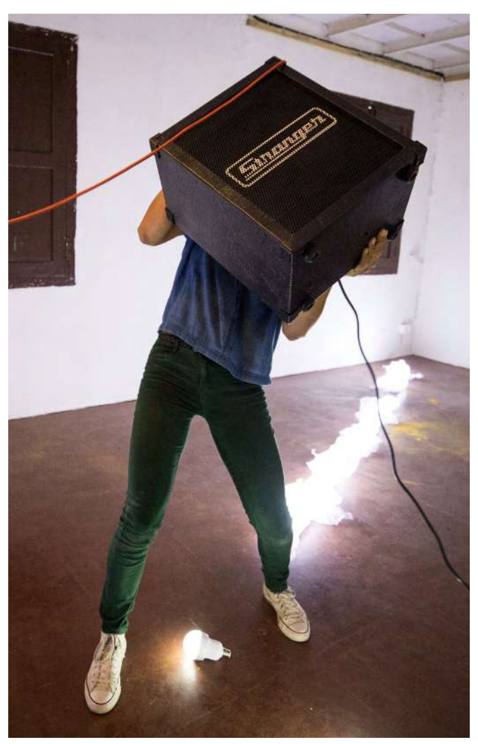
Stills from a live performance of The Long and Short of It at Serendipity Arts Festival 2019.