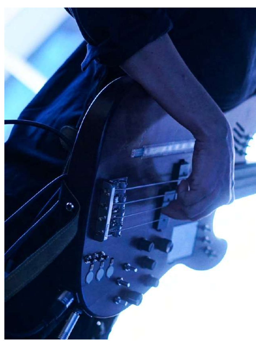
Still from a live performance by Floy Krouchi at Serendipity Arts Festival 2019.