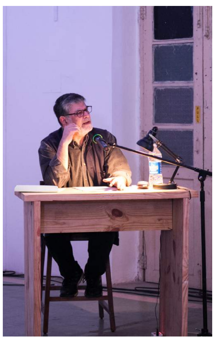
Image \ of \ Rustom \ Bharucha's \ opening \ lecture \ "Questioning \ the \ Protocols \ and \ Possibilities \ of \ Documentary \ The atre: A \ Dramaturgical \ Perspective" \ at \ Connecting \ Realities.