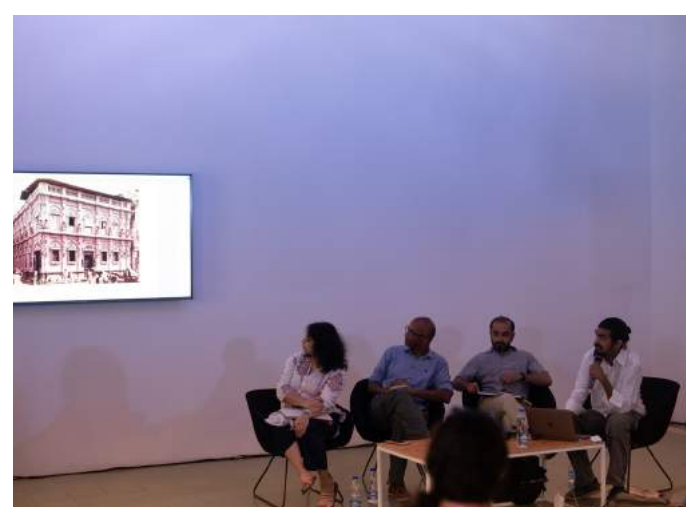
Image\ of\ the\ panel\ titled\ "Archives\ and\ Anti-disciplinarity"\ at\ Connecting\ Realities.\ Photograph\ by\ The\ Lumiere\ Project.