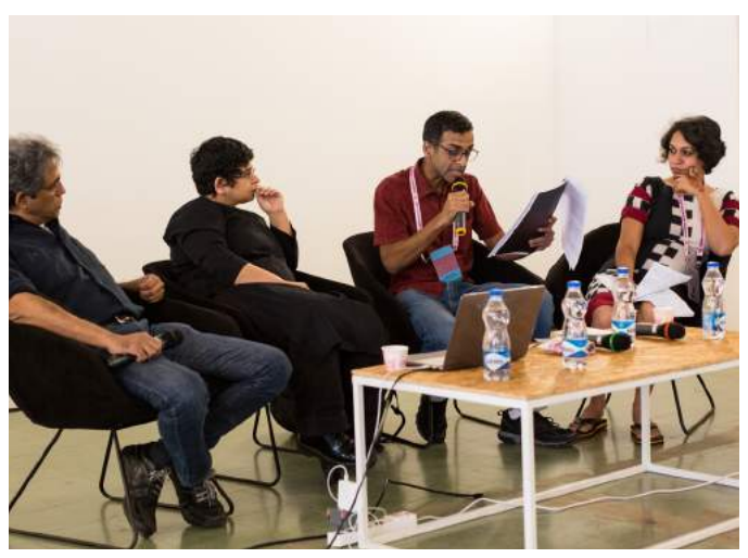
Image \ of the panel \ titled "Jan Sunawayi (People's Court) — Testimonials as \ Documentary Practice" at Connecting Realities.