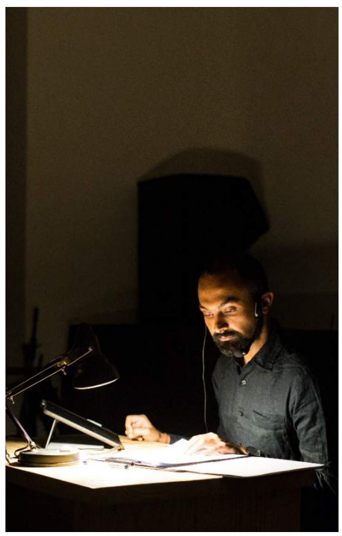
Still from a performance work-in-progress: "Archipelago Archives Exhibit #0: About Archipelago Archives" by Kiran Kumar at Connecting Realities.