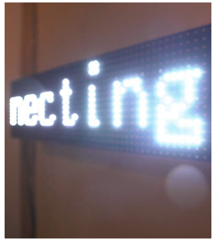
Image\ of\ an\ LED\ ticker\ announcing\ the\ schedule\ of\ Connecting\ Realities\ at\ Serendipity\ Arts\ Festival\ 2019.