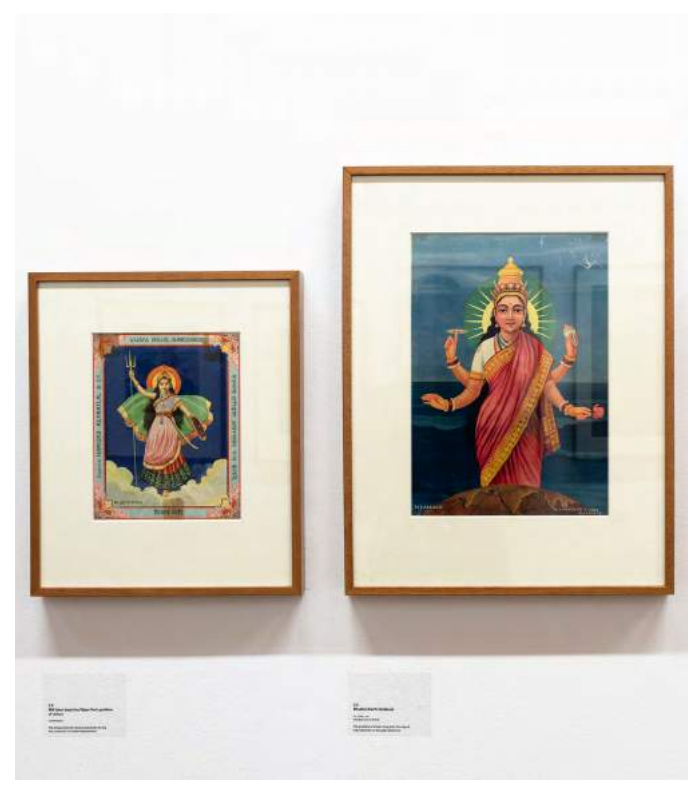
Installation view of "Image Journeys: The Conquest of the World as Picture" at Serendipity Arts Festival 2019.