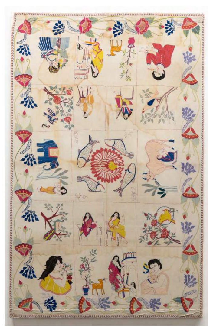
Installation view of an embroidered coverlet, Kantha, early twentieth century, as part of "Image Journeys: The Conquest of the World as Picture" at Serendipity Arts Festival 2019.