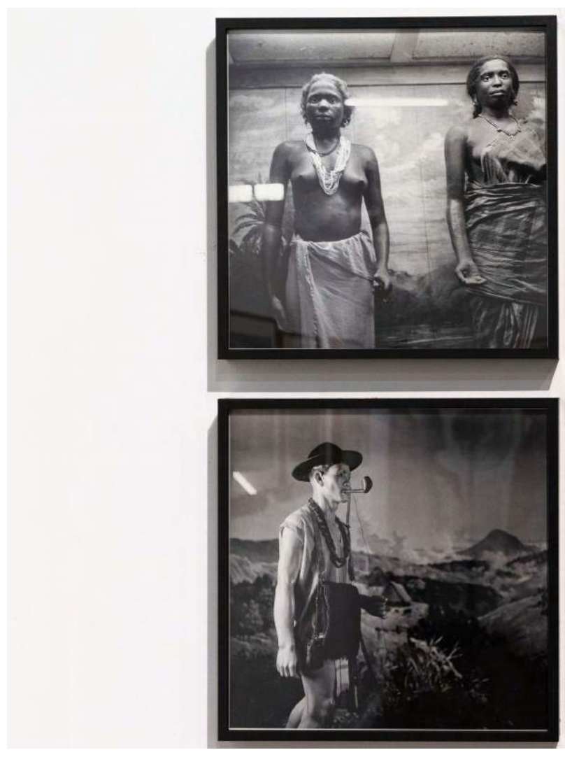
Installation view of "Image Journeys: The Conquest of the World as Picture" at Serendipity Arts Festival 2019.