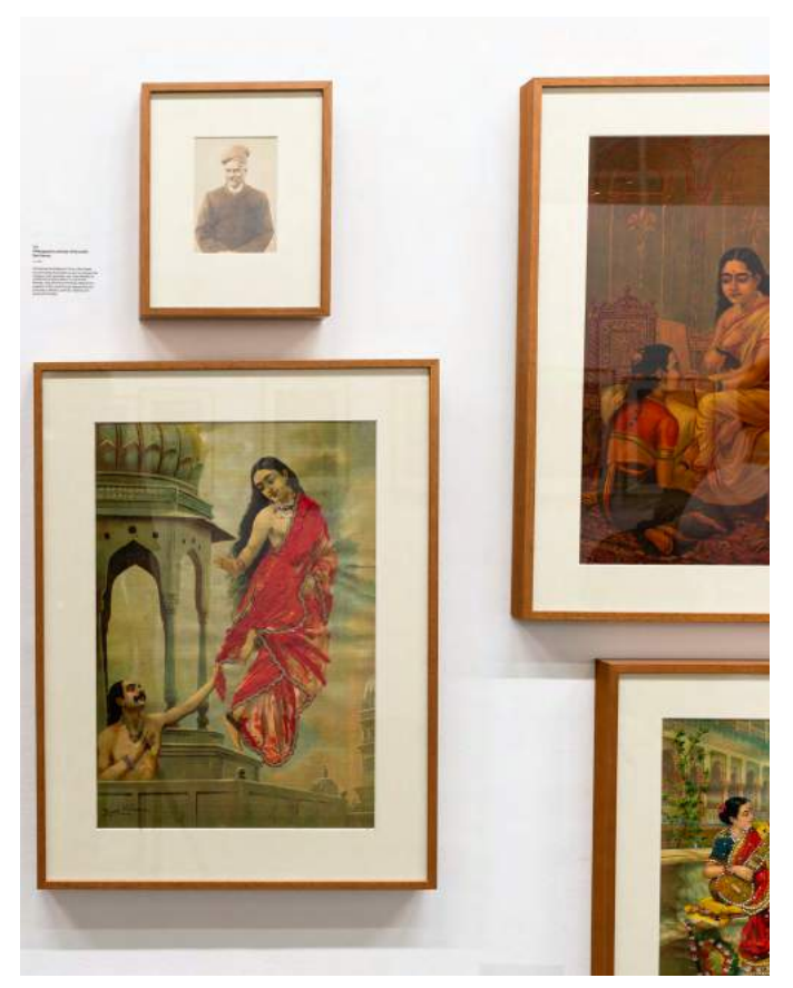
Installation view of "Image Journeys: The Conquest of the World as Picture" at Serendipity Arts Festival 2019.