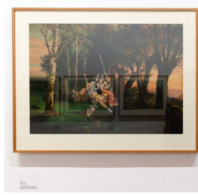
Installation view of "Image Journeys: The Conquest of the World as Picture" at Serendipity Arts Festival 2019.