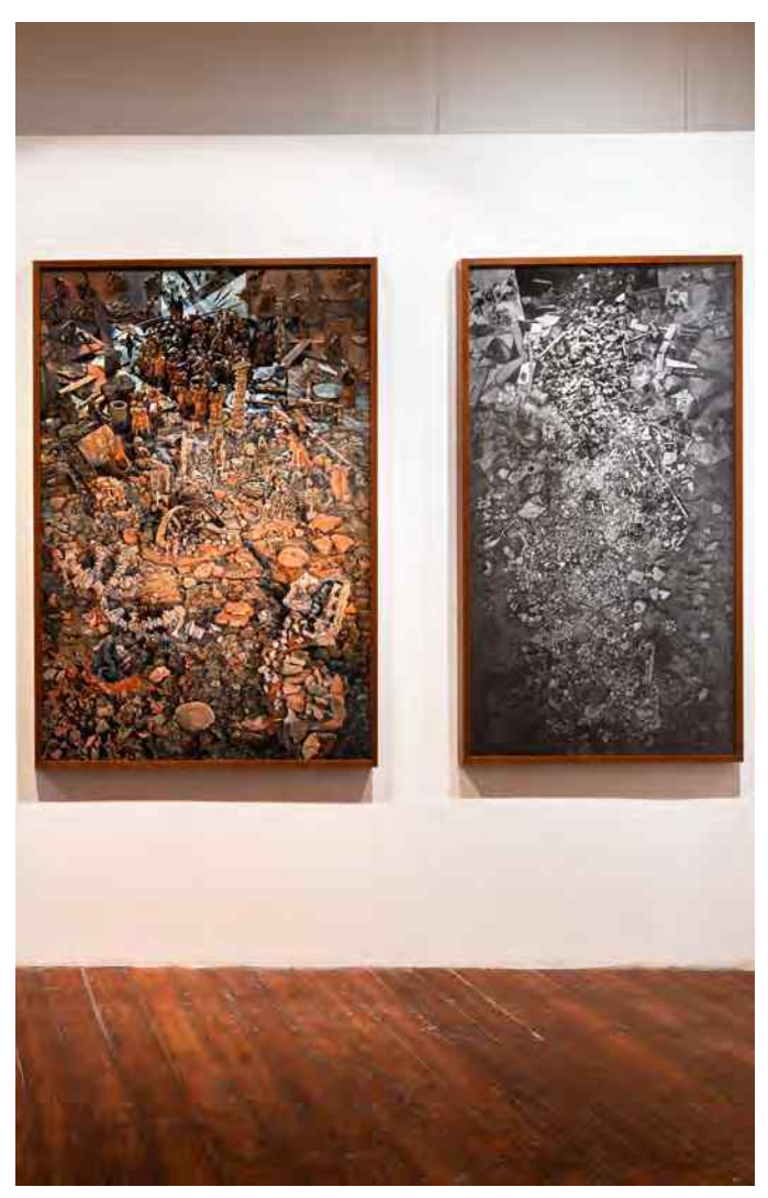
Installation view of "Unearthed" (2019), Vivan Sundaram as part of "Imagined Documents" at Serendipity Arts Festival 2019.