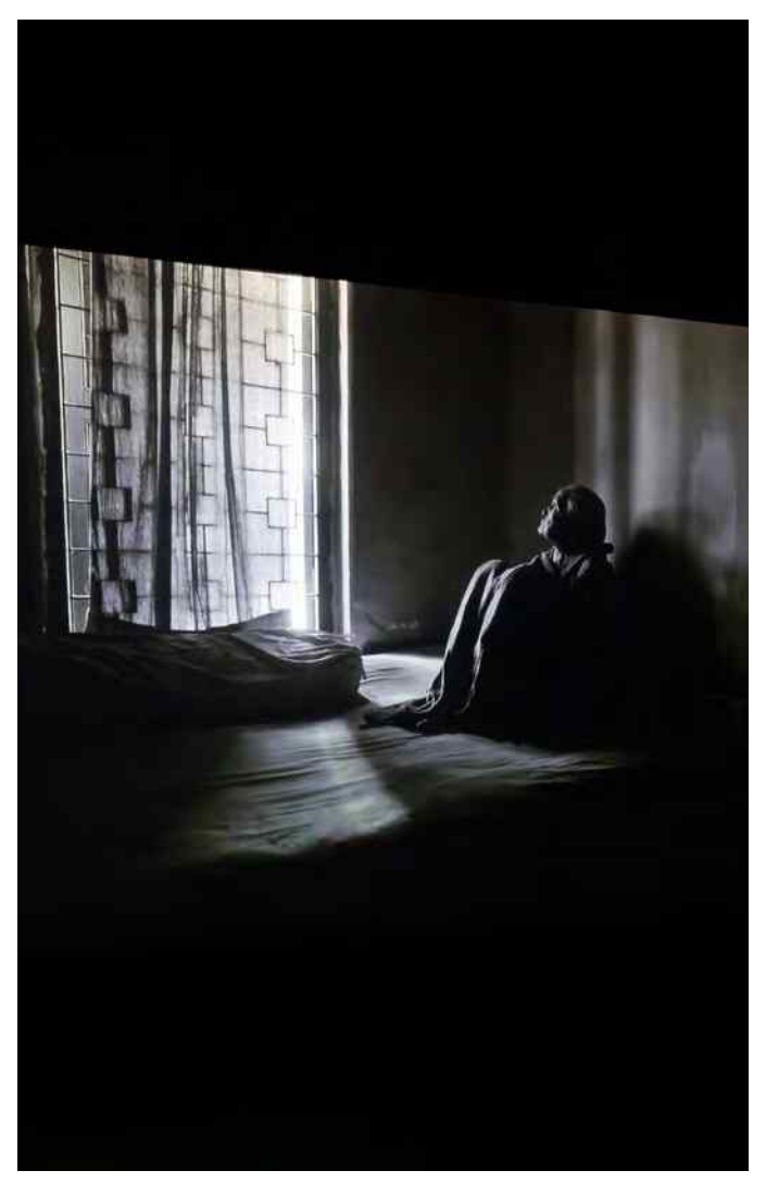
Installation view of "Kheyal" (2015 – 2018), Munem Wasif, as part of "Imagined Documents" at Serendipity Arts Festival 2019.