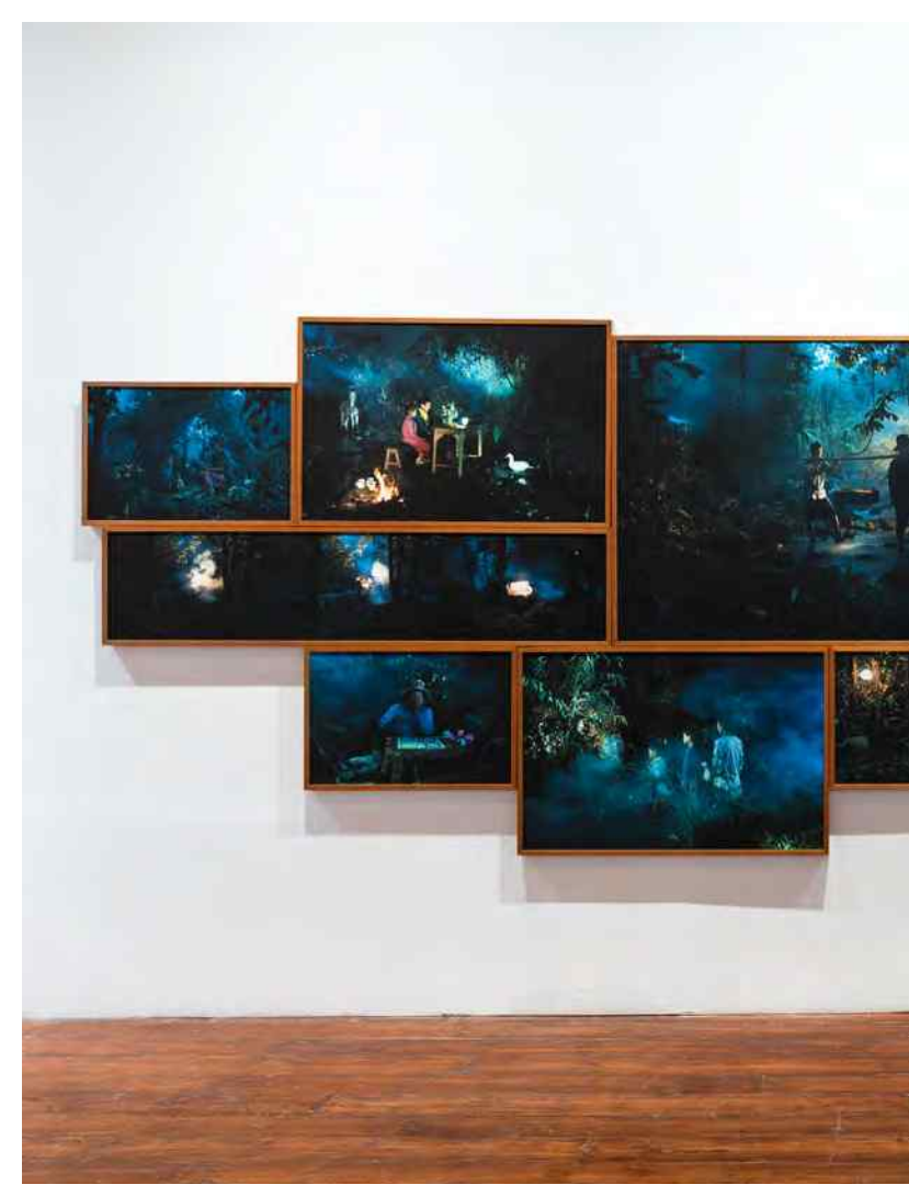
Installation view of "Imagined Homeland" (2018), Sharbendu De as part of "Imagined Documents" at Serendipity Arts Festival 2019.