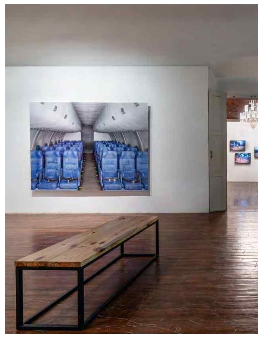
Installation view of "Imagined Documents", curated by Ravi Agarwal at Serendipity Arts Festival 2019.