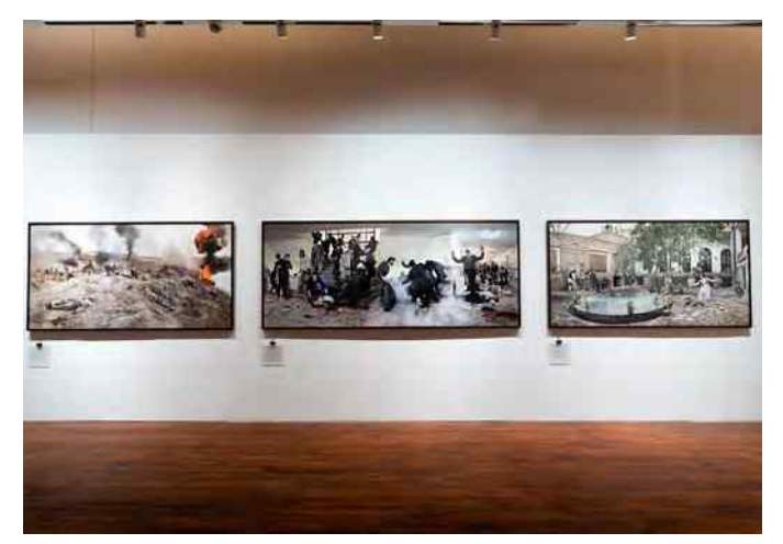
Installation view of "By an Eyewitness" (2012), Azadeh Akhlaghi as part of "Imagined Documents" at Serendipity Arts Festival 2019.