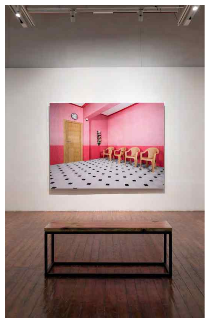
Installation view of artwork by Dia Mehhta Bhupal as part of "Imagined Documents" at Serendipity Arts Festival 2019.