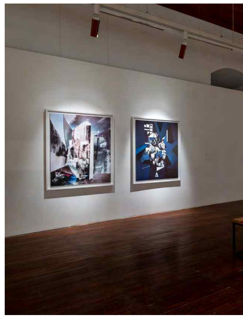
Installation view of artworks by Yamini Nayar as part of "Imagined Documents" at Serendipity Arts Festival 2019.