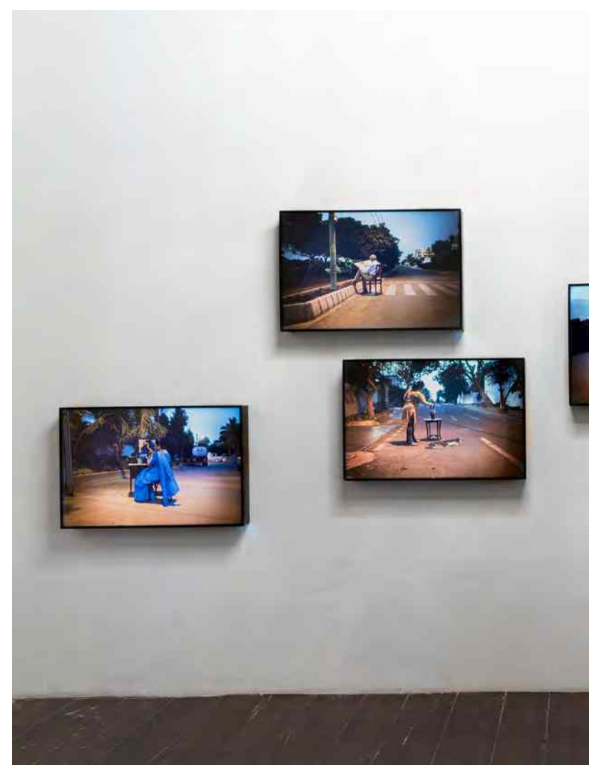
Installation view of "Karachi Series I" (2009), Bani Abidi as part of "Imagined Documents" at Serendipity Arts Festival 2019.