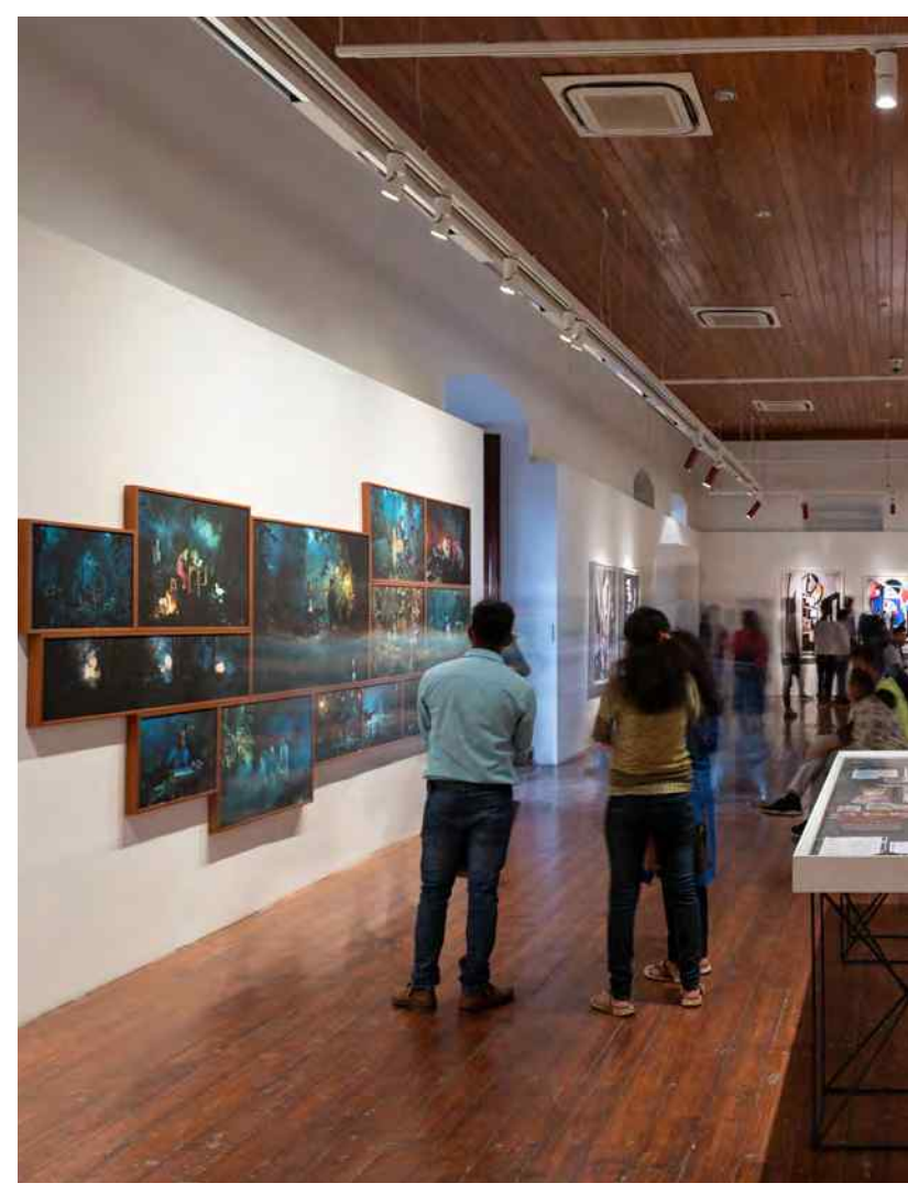
Installation view of "Imagined Documents", curated by Ravi Agarwal at Serendipity Arts Festival 2019.